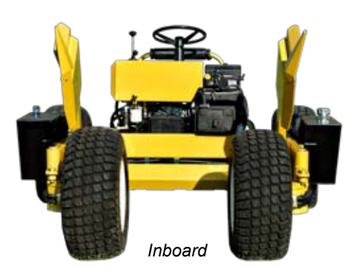
For loading purposes only

The Installer's compact design makes it simple to transport. The front wheels rotate inward, allowing the installer to fit on a standard size utility trailer.