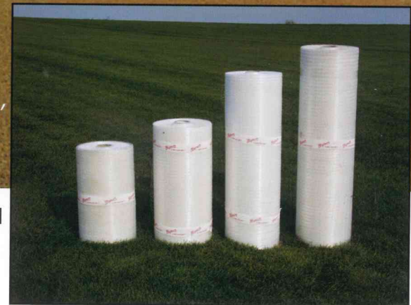
Magnum Big Roll Net

We carry a complete range of Big Roll Net sizes – 23", 29", 40" and 46" – and Field Net sizes – 17' and 20' for all brands of turf equipment. Big Roll Net and Field Net can be combined for bulk discounts.