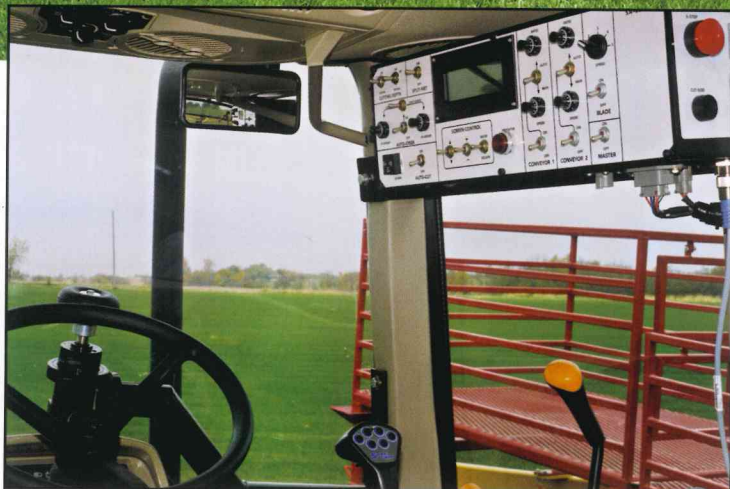
The John Deere model 6415 completes the Magnum 4200AR package.

All Magnum Harvesters offer you the innovation, flexibility, options and performance you need to please more customers, operate more efficiently and generate more revenue.