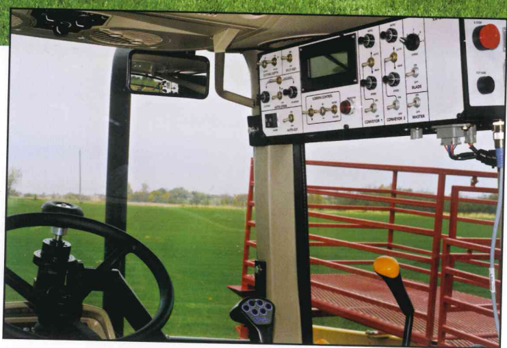
The John Deere model 6415 completes the Magnum 4200AR package.

All Magnum Harvesters offer you the innovation, flexibility, options and performance you need to please more customers, operate more efficiently and generate more revenue.